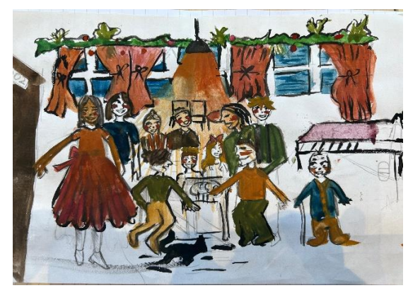
Joy to the World An interpretation of nativity being depicted through art and our culture.